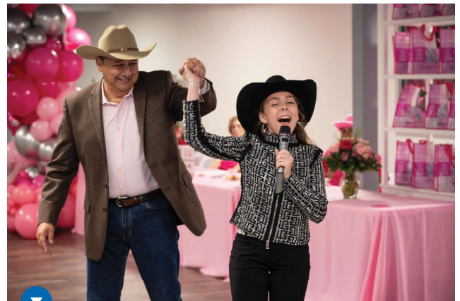
Boots, Bags, and Bling raises funds for breast cancer awareness