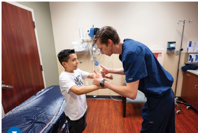
Record number of Mansfield ISD student athletes get sports physicals

Fast TrackER isn't just a physical space; it embodies our commitment to personalized attention. Manned by experienced medical staff, this unit ensures patients receive prompt care before heading home to heal.