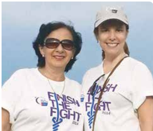
The Methodist Richardson Cancer Center team participated in the American Cancer Society Relay for Life – Richardson/Plano on May 9.