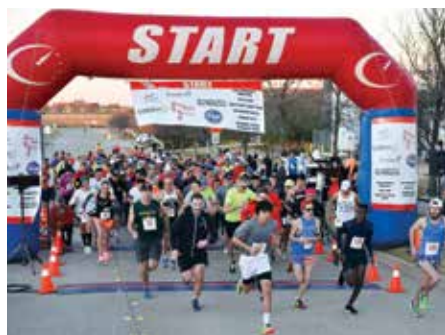
Hundreds of community members help support the heart care Methodist Mansfield provides at the hospital's third annual Run with Heart event.

Learn more at MethodistHealthSystem.org/MansfieldCardiology .