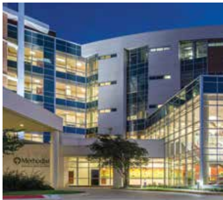
Methodist Mansfield opened the Amon G. Carter Foundation Heart and Vascular Center in December 2015, expanding cardiology services.